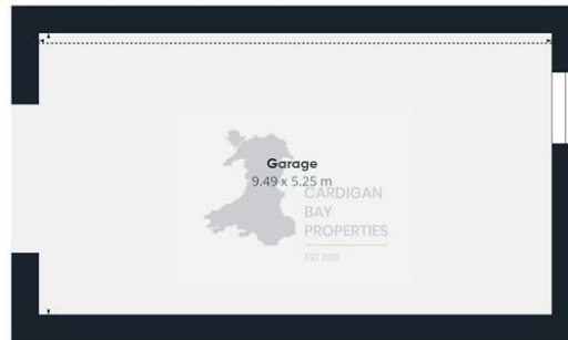
Floor 0 Building 3

Approximate total area m 172.8 m 2 Reduced headroom 5.6 m 2